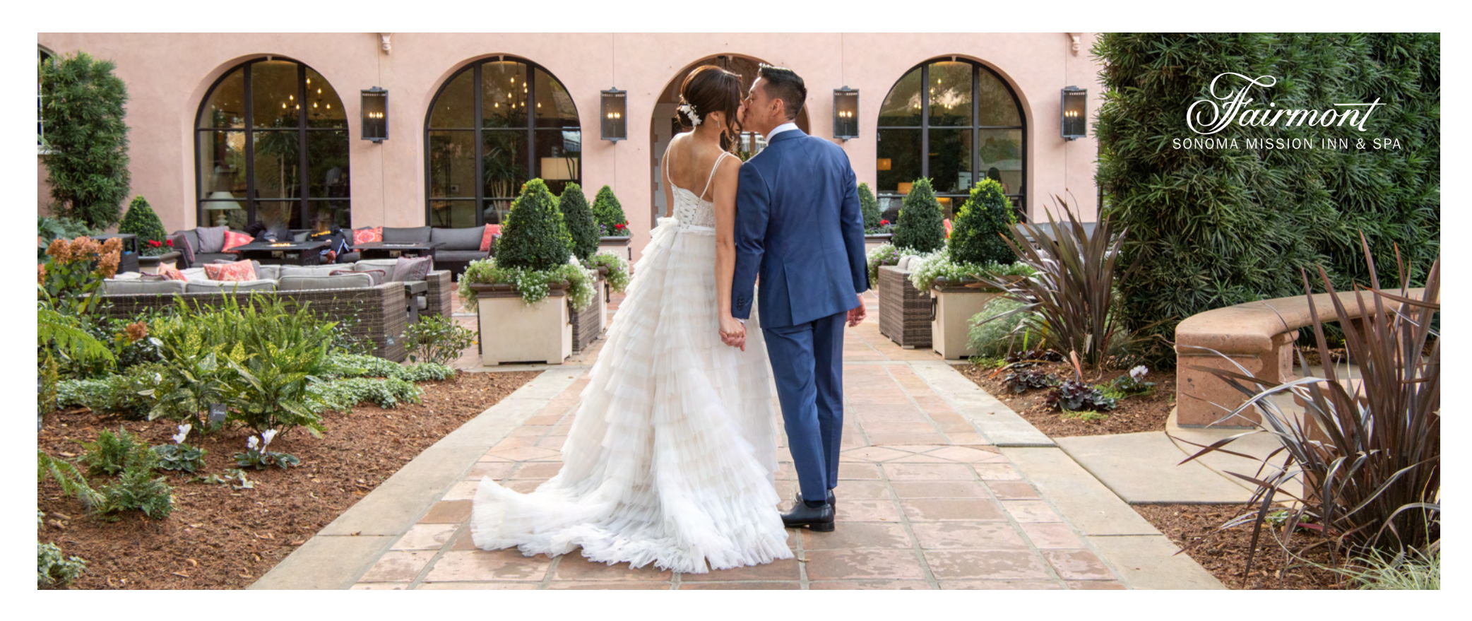
Your HAPPILY EVER AFTER Begins with Fairmont Sonoma